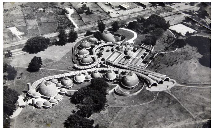
Figure 2: School of Plastic Arts, Havana, Cuba. Ricardo Porro, 1961

Architect John A. Loomis writes that, "Porro's poetically interpretive reading of Cuban history provided a theoretical framework for a formal elaboration of cultural themes heretofore unknown in Cuban architecture." 8 Porro literally used his School of Plastic Arts and School of Modern Dance as an encapsulation of the great fervor around the revolutionary poetry and liberation happening in post-1959 Cuba. The plan for the School of Modern Dance employs a series of elliptical halls organized along curvilinear walkways, reminiscent of an African village that Porro used to create an alternative narrative centered on Afro-Cuban heritage, rather than Spanish colonization. 9 He goes on to use a series of complex splines in plan, curving trusses in section and various domes to engage, reflect and mimic the program of the building, creating a truly rhythmic space for dancing and art.