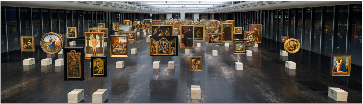
Figure 1: Sao Paulo Museum of Art, Main Gallery space with Glass Easels, Lina Bo Bardi, 1968