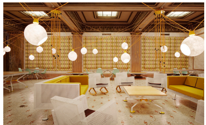
Figure 3: Randolph Square, custom furniture, wallpaper and malleable lighting system. Pedro y Juana, 2015.

Pedro y Juana provided Biennial-goers with a complex, but familiar space. At times, the buildings history played an integral role in the definition of their project and at others provided them with strange juxtapositions that allowed a late-19th century Beaux Arts room to turn into an interactive space filled with micro-territories of study, leisure and play, transplanting ideas like traffic, networks and participatory politics into lighting systems, furniture and urban interiors.