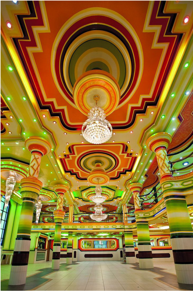
Figure 4: Interior of a Salon de Evento in El Alto, Bolivia. Freddy Mamani Silvestre, 2011.

participation is a key element in Mamani's work, but also hardwired into the fabric of El Alto's urbanization. 13 In effect, he has created Salones de Eventos & Chalets, which are neo-postmodern, culturally supergraphic and multi-story shape-driven public party buildings with private houses on top. 14